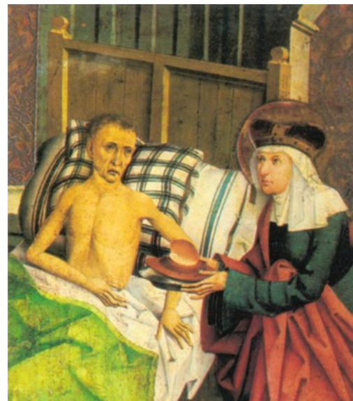
Agnes of Bohemia Tending the Sick by the Bohemian Master, 1482, National Gallery, Prague

Saint Agnes is known for founding the Hospital of St. Francis and financing the construction of Poor Clare monastery in Prague. She was canonized in 1989 by